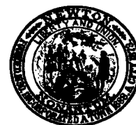
Setti D. Warren Mayor

1164 Centre Street, Newton Center, MA 02459-1584 Chief: (617) 796-2210 Fire Prevention: (617) 796-2230 FAX: (617) 796-2211 EMERGENCY: 911